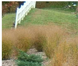
Panicum virgatum 'Shenandoah'

April: Leave grass clippings; mulch properly