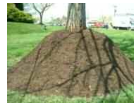
Volcano mulching suffocates surface roots of trees.